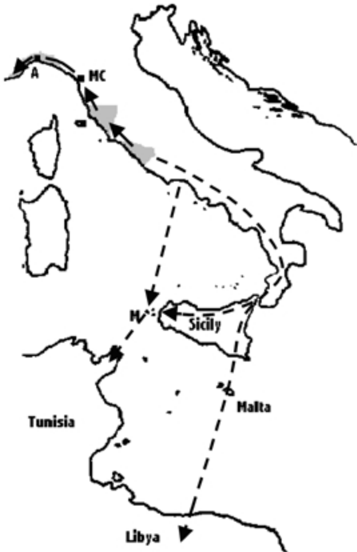
FIG. 1.—Study area. A = Arenzano; MC = Mount Colegno; M = island of Marettimo. Solid arrow = route observed; sketched arrow= alternative routes. In grey, breeding areas of Short-toed Eagles in Liguria and central Italy.

[Área de estudio. A = Arenzano; MC = Montet Colegno; M = isla de Marettimo. Flecha gruesa continua: ruta observada; flecha fina discontinua: rutas alternativas. En gris se señalan las áreas de cría de la Culebrera Europea en Liguria e Italia central.]